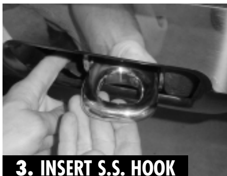
3. INSERT S.S. HOOK

STEP 3. Insert the stainless steel tow hooks into the tow hook mounts. (See photo above.)