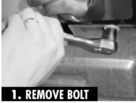
1. REMOVE BOLT

STEP 1. Using a 15mm socket, Remove the 8 bolts from the skid plate. (See photo above.)