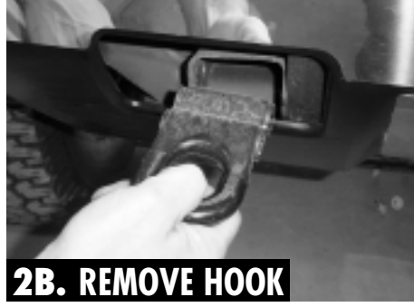
2B. REMOVE HOOK

STEP 2. Remove the factory tow hook bolts and remove the tow hooks. (See photos above.)