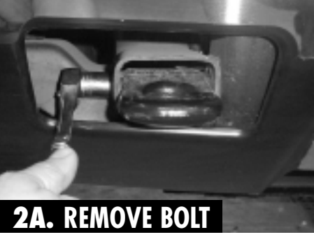
2A. REMOVE BOLT

STEP 1. Using a 15mm socket, Remove the 8 bolts from the skid plate. (See photo above.)