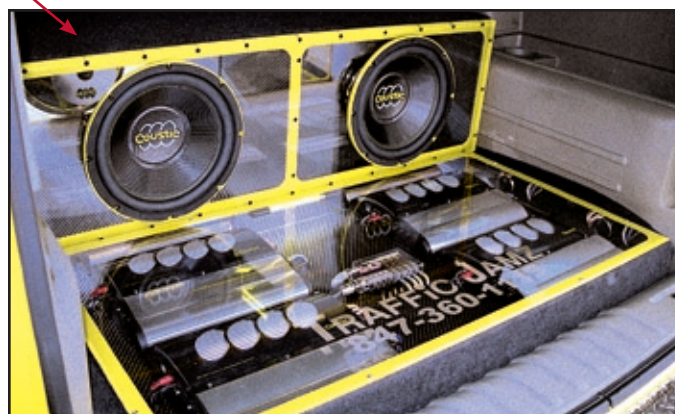
"GET REAL" POWER SOUND SYSTEM

For further information or if you have any questions, please contact Cory Polka at 847-997-4377 or 847-662-7722.