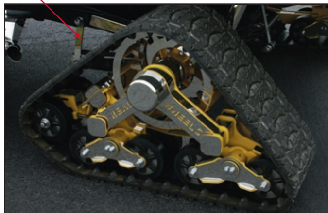
MATRACKS w/CUSTOM STAINLESS STEEL